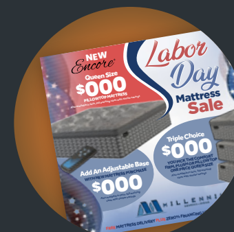
Labor Day Mattress Sale Page 9