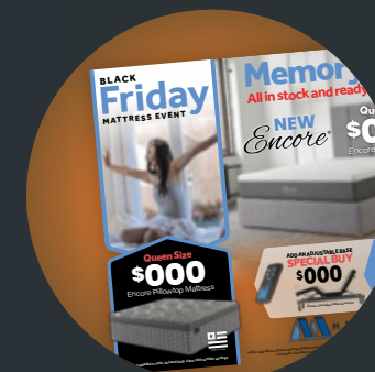
Black Friday Mattress Event Page 13