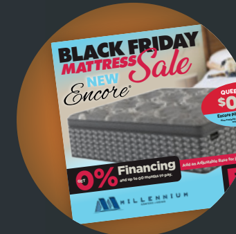
Black Friday Mattress Sale Page 12