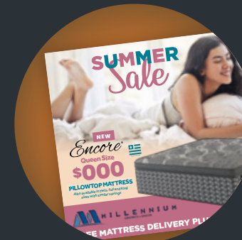
Summer Sale Page 6

PRINT / DIGITAL / POINT-OF-SALE / SOCIAL