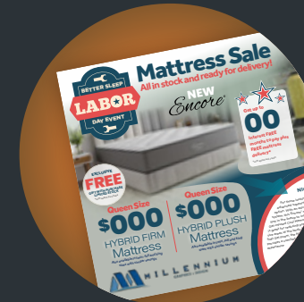
Labor Day Mattress Sale Page 8