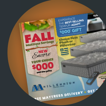
Fall Mattress Savings Page 11