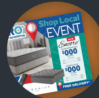
Shop Local Event Page 10