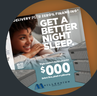
Get A Better Night Sleep Event Page 7